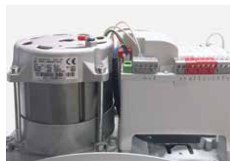
Sturdy and performing motors